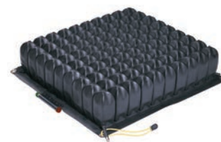
HIGH PROFILE® QUADTRO SELECT®