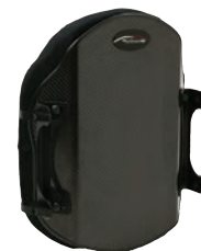
JETSTREAM PRO® BACK SUPPORT SYSTEM