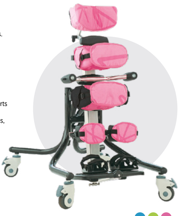
Available in 3 fabric colors