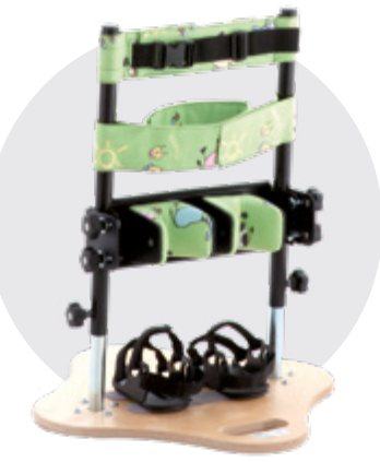
Available in 1 fabric colorzz combination