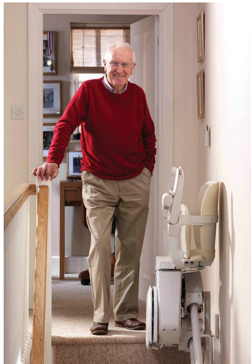
The Siena's slimline design allows others to still use the stairs

The Siena also comes in two chair widths allowing you to pick the one most comfortable for you, your home and your life.