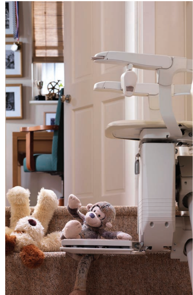
Sensors detect any obstructions on your stairs

“We are delighted with the stairlift. My wife enjoys the ride. It gives her independence. She finds it very easy to use”