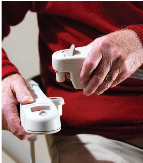
Seatbelt can be fastened with one hand

Effortless and simple. This sums up beautifully just how much thought and care we have designed into each and every function of our Siena stairlift. From the safe and easy-to-use seatbelts, to stairlifts that fit on either side of the stairs and on all types of staircases, we have made your Siena stairlift simple, safe and reliable.