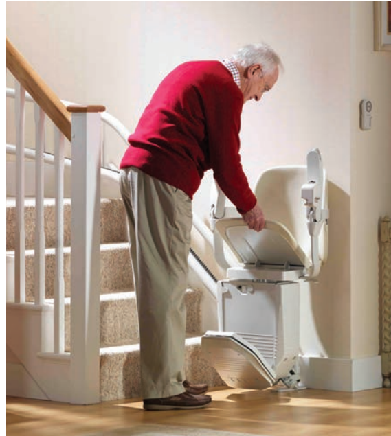
The Siena folds neatly away when not in use