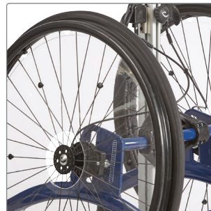
Closed push rims