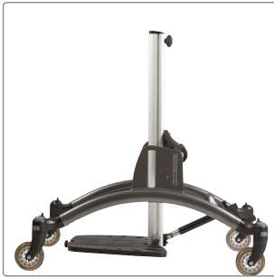
Size 3: Anthracite grey