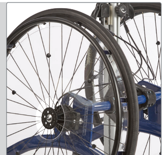
Open push rims