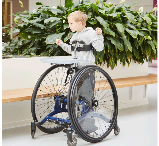
2 driving wheels, 4 castors with or without brakes.