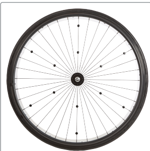
Available in 22°, 24°, 26°, 29°, 32°, 36°