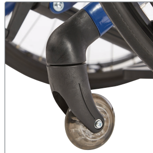
Without brakes (driving wheels must be fitted)