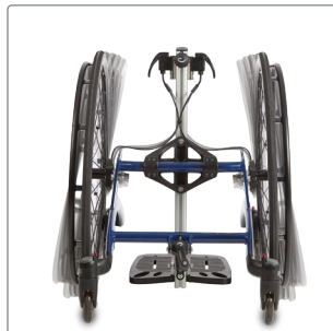
Standard camber angle: Size 1: 8°, Size 2: 6°, Size 3: 6°, Size 4: 4° Available to choose standard plus: +3°, +6°, -3°, -6°