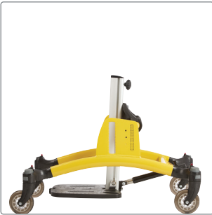
Size 1: Yellow