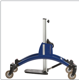
Size 2: Blue