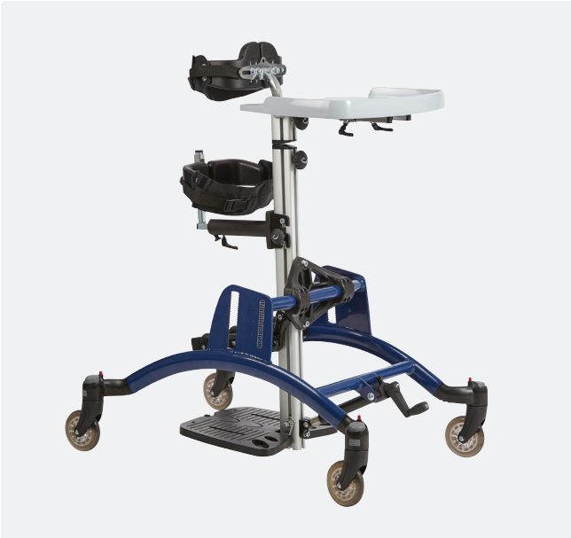
No driving wheels, 4 castors with brakes. Prepared for driving wheels, 4 castors with brakes