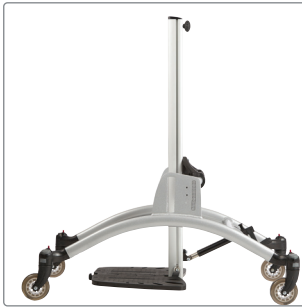
Size 4: Silver