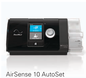
AirSense 10 AutoSet Premium auto-adjusting pressure device with integrated humidifier and advanced event detection.