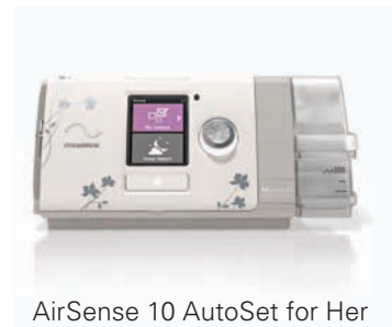
AirSense 10 AutoSet for Her Premium auto-adjusting pressure device for female patients. Also includes an integrated humidifier, and advanced event detection.