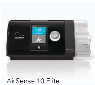
AirSense 10 Elite Premium fixed-pressure device with integrated humidifier and advanced event detection.